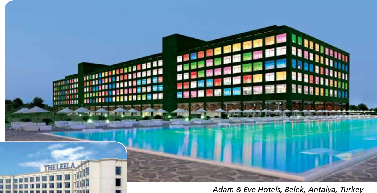
The Leela Palaces, New Delhi, India