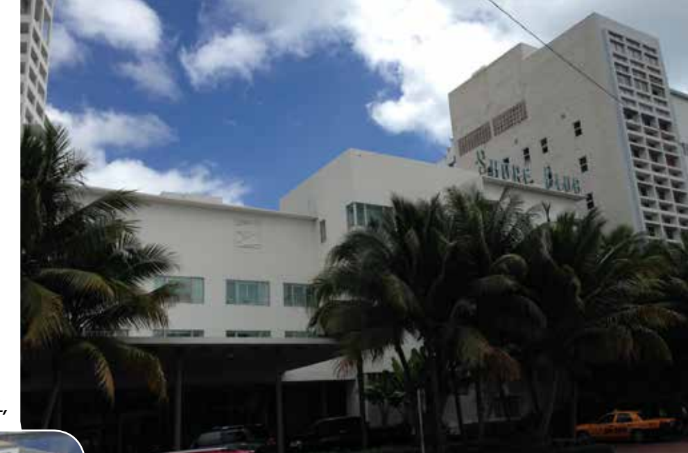
The Shore Club Hotel, Miami Beach, FL,