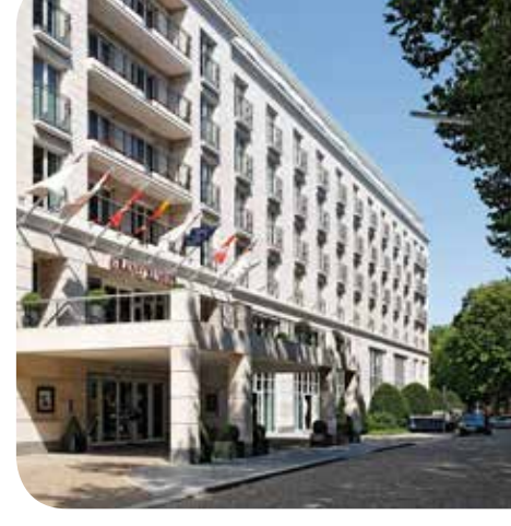
Elysee Hotel, Hamburg, Germany

The company maintains subsidiaries in Europe, the USA, Canada, India and China, plus partnerships with qualified contractors and distributors in a number of countries. KEMPER SYSTEM has evolved to become a worldwide specialist for waterproofing and coating and has added decorative and industrial floor coatings to its range of products.