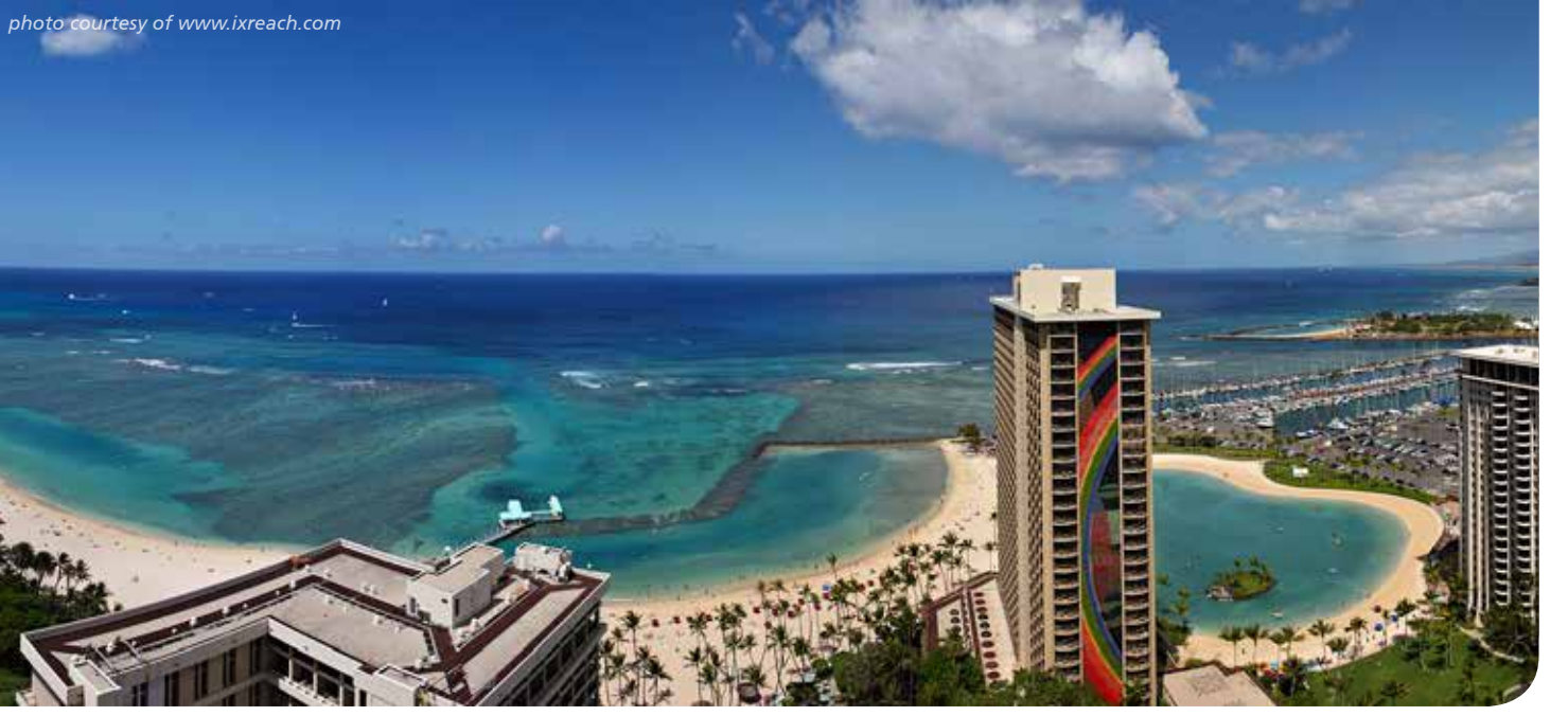
Hawaiian Hilton Village, Honolulu, Hawaii

Hawaiian Hilton Village, Honolulu, Hawaii, Kemper System installed balcony waterproofing at the Hawaiian Hilton Village. EP Primer and 2K-pur with 165 Fleece was used with alkalinity protection with tile installed as the overburden. There was no disruption to the hotel or its guests due to the odorless system installed.