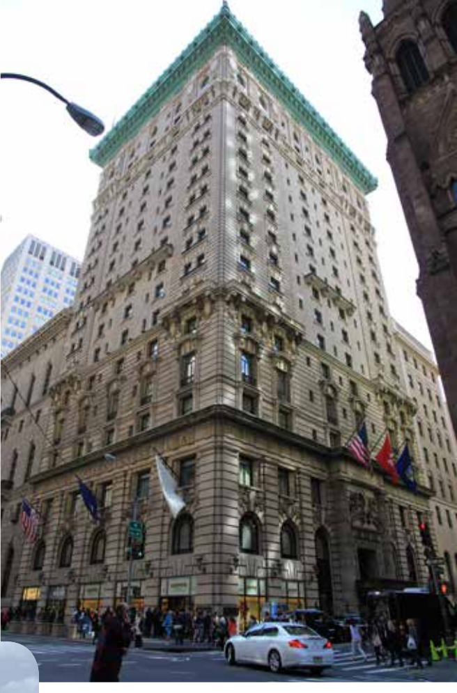
The Peninsula Hotel New York, New York

At Disney's Swan and Dolphin Hotel in Orlando, FL, the liquidapplied system was able to wrap every shape and contour of the shell-like water features. Kemperol® waterproofing membranes easily address the most exacting details of design and stringent project constraints.