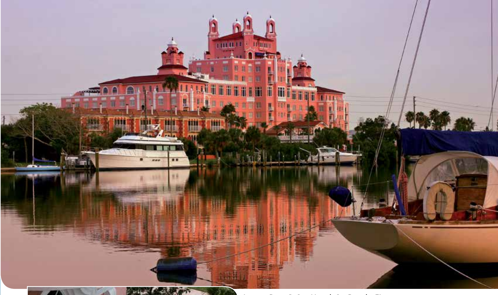
Loews Don CeSar Hotel, St. Beach, FL

Loews Don CeSar Hotel in St. Pete Beach, Kemper System delivered odor-free solutions to restore the main roof and to protect a spectrum of architectural designs throughout the historic landmark hotel -- from the parking deck ramps to the luxurious setback terraces.