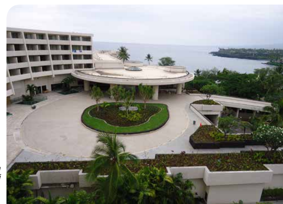
Sheraton Kona Resort & Spa Kona, Hawaii

Hawaiian Hilton Village, Honolulu, Hawaii, Kemper System installed balcony waterproofing at the Hawaiian Hilton Village. EP Primer and 2K-pur with 165 Fleece was used with alkalinity protection with tile installed as the overburden. There was no disruption to the hotel or its guests due to the odorless system installed.